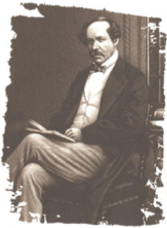
Sir Henry Creswicke Rawlinson

Rawlinson also shared this assumption with father Hinks. He suggested calling this yet unknown language ‘Akkadian’. The title “King of Sumer and Akkad” was already known to Rawlinson from the Mesopotamian documents he studied. The name ‘Akkad’ was known to him from the biblical sources. The name ‘Sumer’, however, was not mentioned in any other source but the cuneiform ones. Therefore, and as part of Rawlinson’s general tendency to use the findings from the ancient Near-East to affirm the biblical and the classical sources 11 , he decided to call this yet unknown language: ‘Akkadian’.